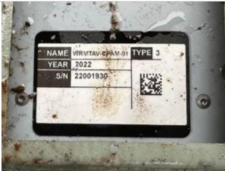
WARMATE: Type 3 Year: 2022 S/N: 22001930