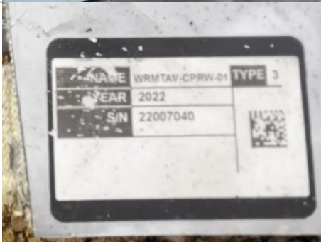
WARMATE: Type 3 Year: 2022 S/N: 22007040