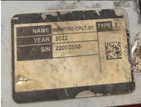
WARMATE: Type 3 Year: 2022 S/N: 22002508