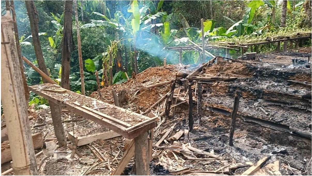
Camps Burned Down By the Thermobaric (Vacuum) Booms