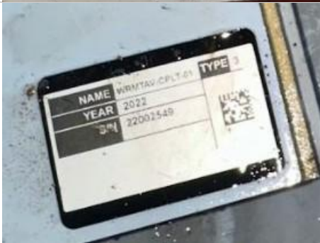
WARMATE: Type 3 Year: 2022 S/N: 22002549