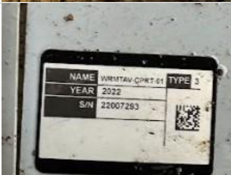
WARMATE: Type 3 Year: 2022 S/N: 22007293